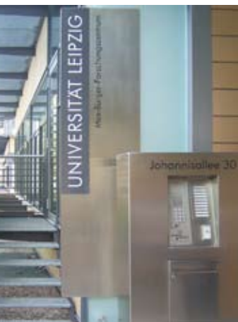
Max Bürger Research Centre