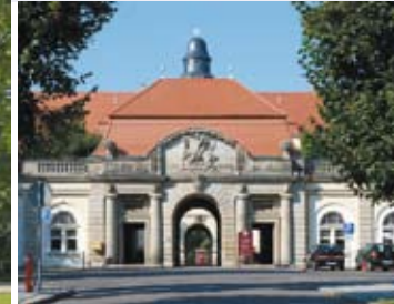
Leipzig University Hospital, Leipzig Cardiology Centre and the St. Georg Hospital (l-r)

for all diseases of the cardiovascular system. Adults and children alike benefit from its specialized delivery of cardiac surgery, internal medicine/cardiology and paediatrics/paediatric cardiology. Within its capacity of 350 beds and 10 outpatient clinics, more than 19,000 patients are treated every year to the highest international standards.